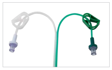
Colour-coded Siamese tubing For clearer identification of high and low flow drug administration.