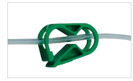
Halkey Roberts clamp

Minimises the risk of back-tracking and enhances patient safety.