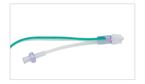
Multi-lumen from hub to tip Keeps infusions separate, reducing the risk of drugs mixing.