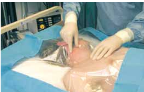
Reducing the risk of infection