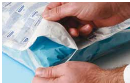
Saving time and money