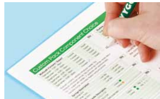
Our commitment to you