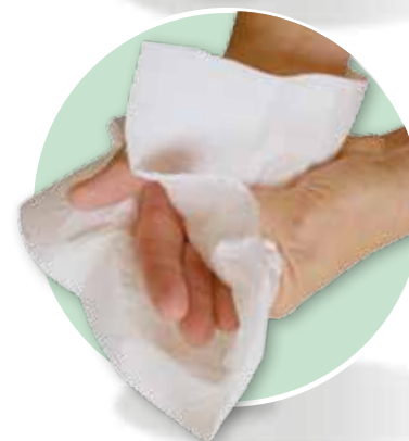
STEP NINE Dry hands thoroughly.