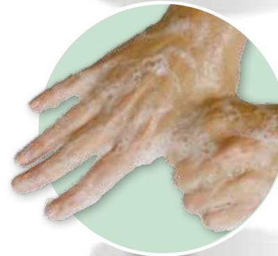
STEP SIX Wash each thumb by clapping and rotating in the palm of the opposite hand.