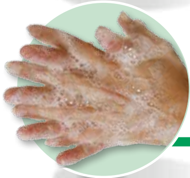
STEP FOUR Palm to palm fingers interlaced.