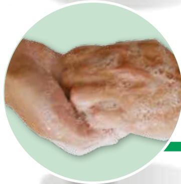
STEP FIVE Backs of fingers to opposing palms with fingers interlocked.