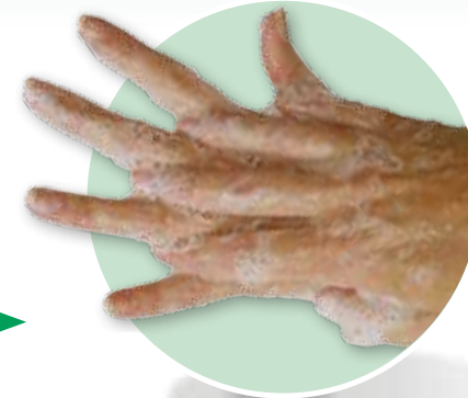
STEP THREE Right palm over back of left hand and left palm over back of right hand.