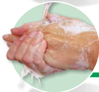
STEP EIGHT Rinse hands under running water.