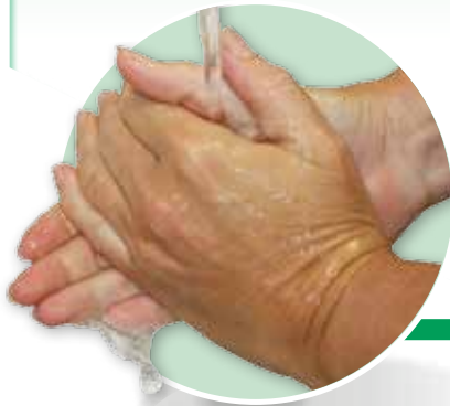
STEP ONE Wet hands thoroughly before applying washing agent.

A nine step handwashing technique was devised by Ayliffe et al (1978), and it is used regularly by healthcare professionals. Using it yourself may improve the care of your catheter. The technique uses soap or an antiseptic solution and running water, and each step consists of five strokes forward and five backward.