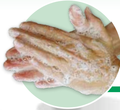
STEP TWO Rub palm to palm.